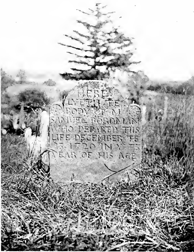
TOMBSTONE OF SAMUEL BORDMAN.